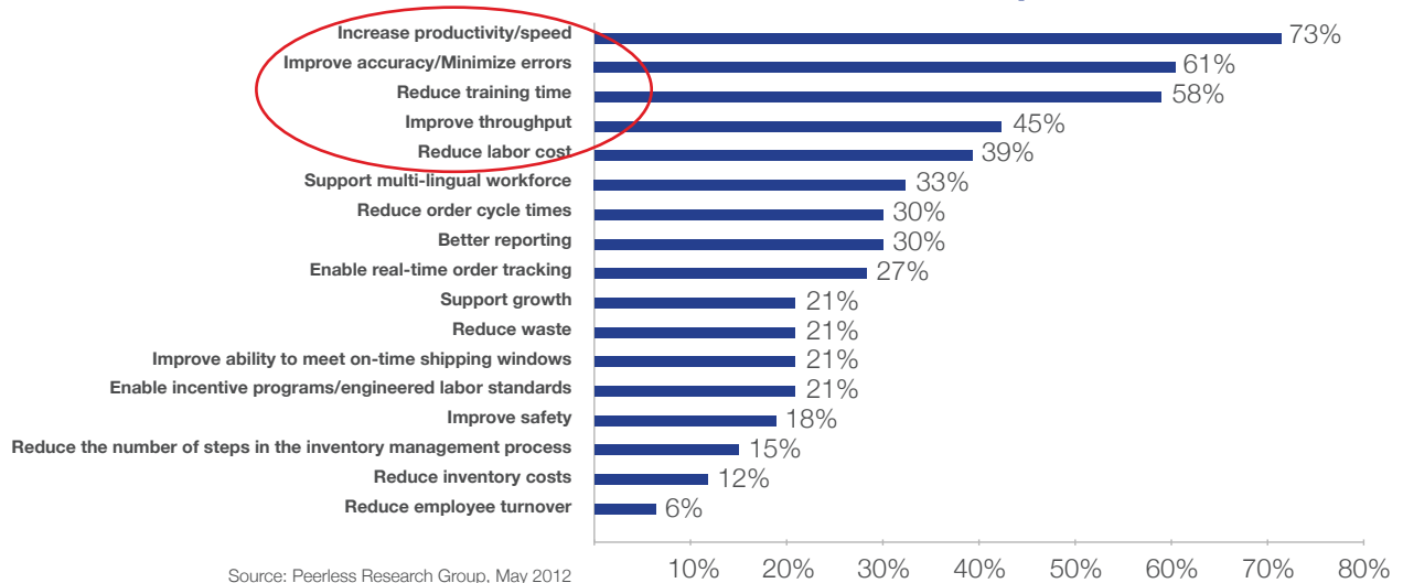
Source: Peerless Research Group, May 2012